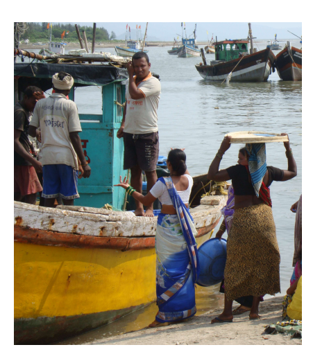
Fig. 1. Fisheries landing center in Alibaug village.

The app, mKrishi, is freely available to the fishers. Its main feature is a map indicating the locations at which the concentration of fish is predicted to be high at the moment. The predictions are derived from satellite data about the thermal fronts in the water and the water color. For example, the water color gives an indication of the amount of plankton, which is a crucial source of food for the fish. Thus, a large amount of plankton is likely to coincide with a high concentration of fish. A second important feature of the app is weather forecasts, specifically forecasts of the speed and direction of the wind. See Fig. 2 for screenshots of these two features of the mKrishi app. In addition, the app provides information about good fishing practices and a few other issues. With respect to gaining an overview the app has affected the fishers' ways of working in multiple ways: